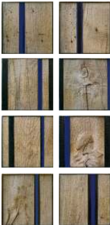
9 a - i »saw cuts« oak, foam material 8,3 x 8,3 inch