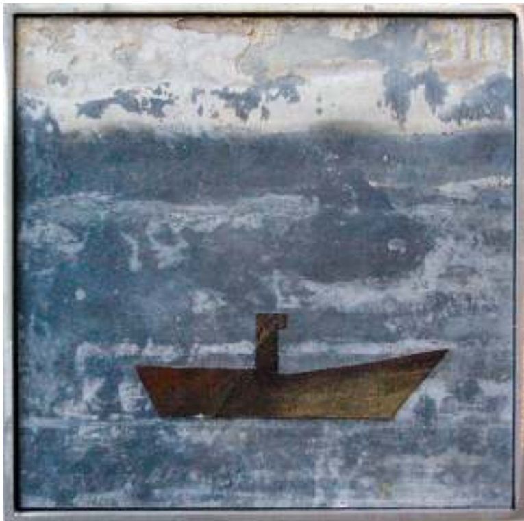
8 a - d »ships« lead, sand paper 8,4 x 8,4 inch