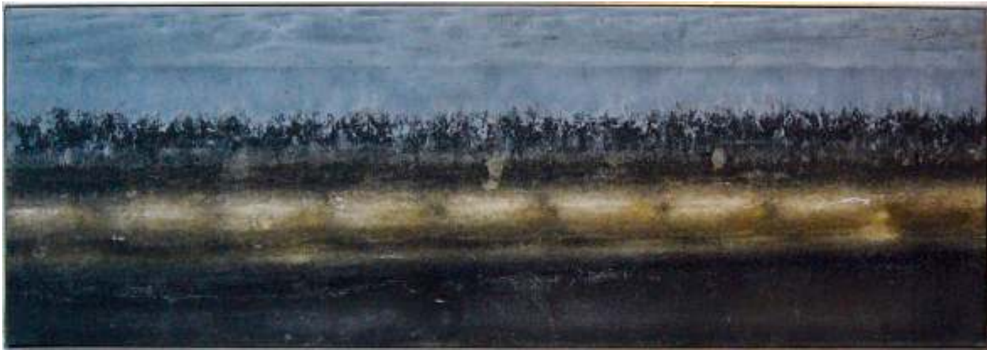
1 »rainy landscape« zinc sheet 12,2 x 34,8 inch 1998