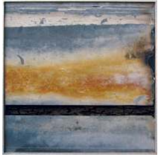
4 tryptichon zinc sheet, bog oak 13,8 x 13,8 - 13,8 x 6,7 - 13,8 x 13,8 inch 2007