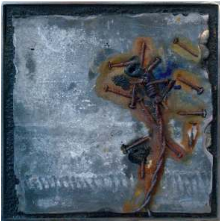
10 a - d »boundaries« lead, nails, wire 5,7 x 5,7 inch