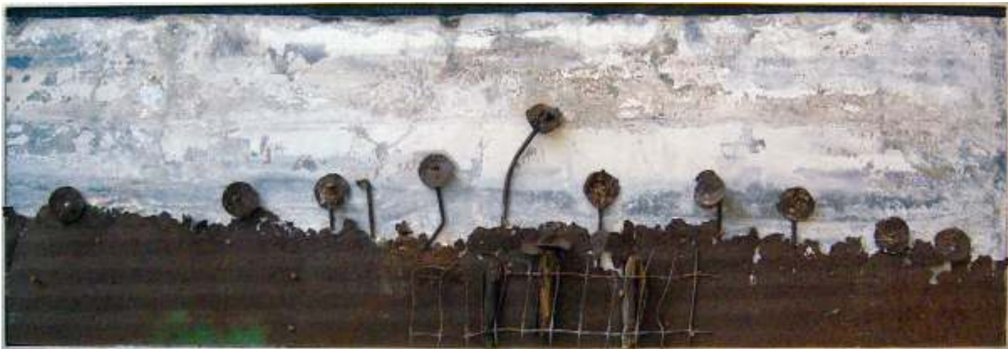
3 b »rosery« lead, steel plate 12,2 x 35,4 inch 2007