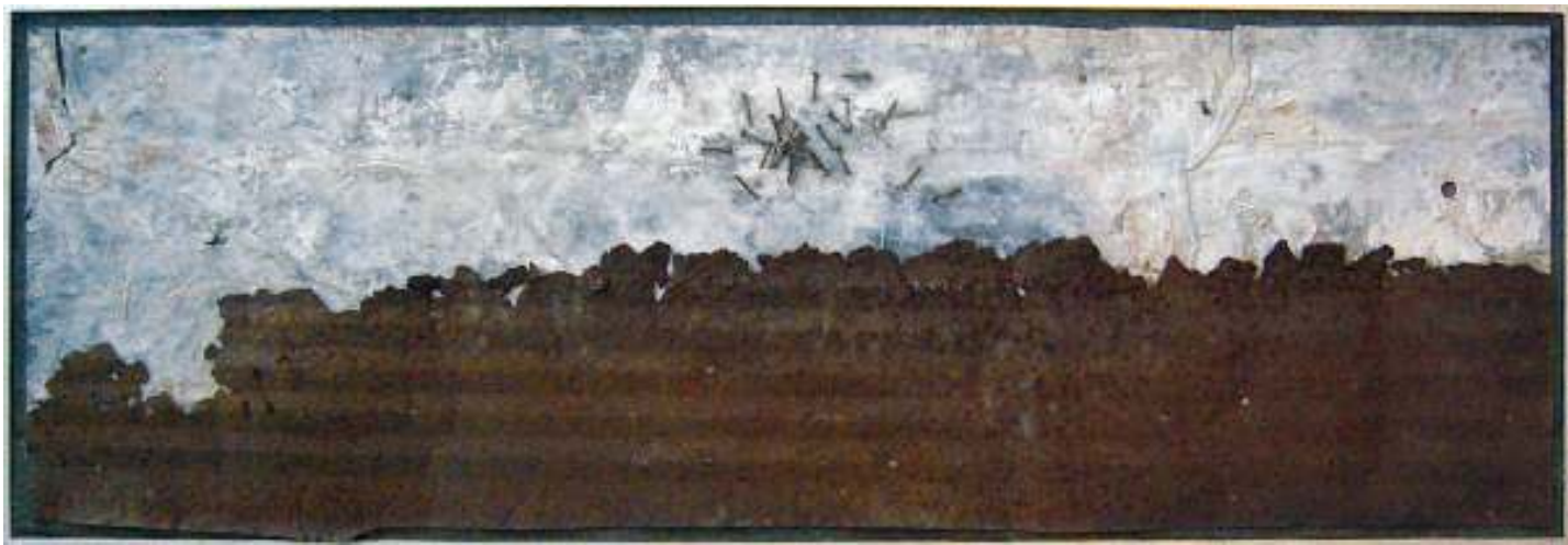
3 a »dandelion clock« lead, steel plate 12,2 x 35,4 inch 2007