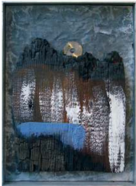
7 a - d »burned cities« lead, burned poplar wood 9,5 x 13,8 inch